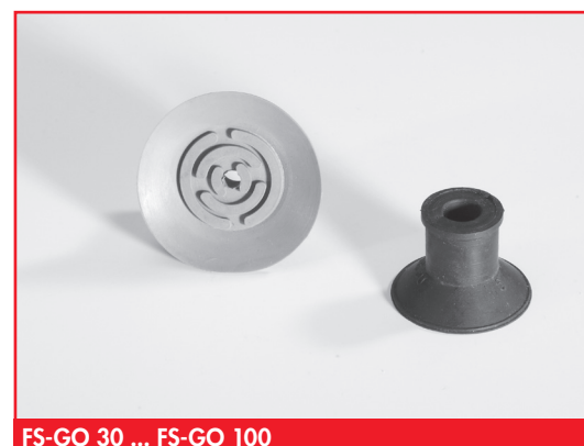
FS-GO 30 ... FS-GO 100