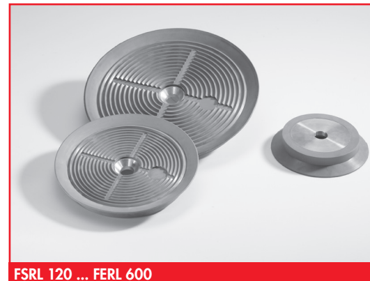
FSRL 120 ... FERL 600

* Specifications at 60 % vacuum w/o safety factor, on smooth, dry surfaces ** Volume with suction pad not engaged and unloaded