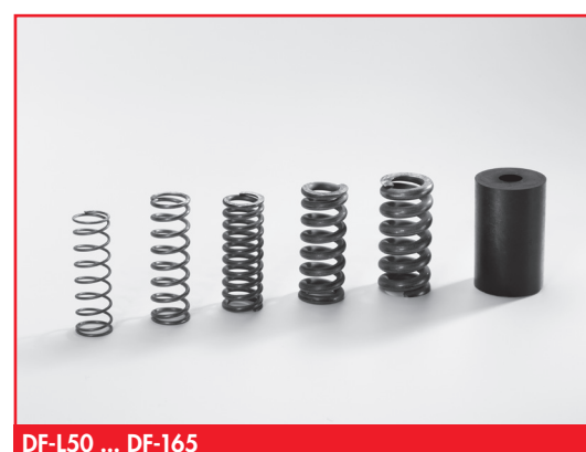
DF-L50 ... DF-165